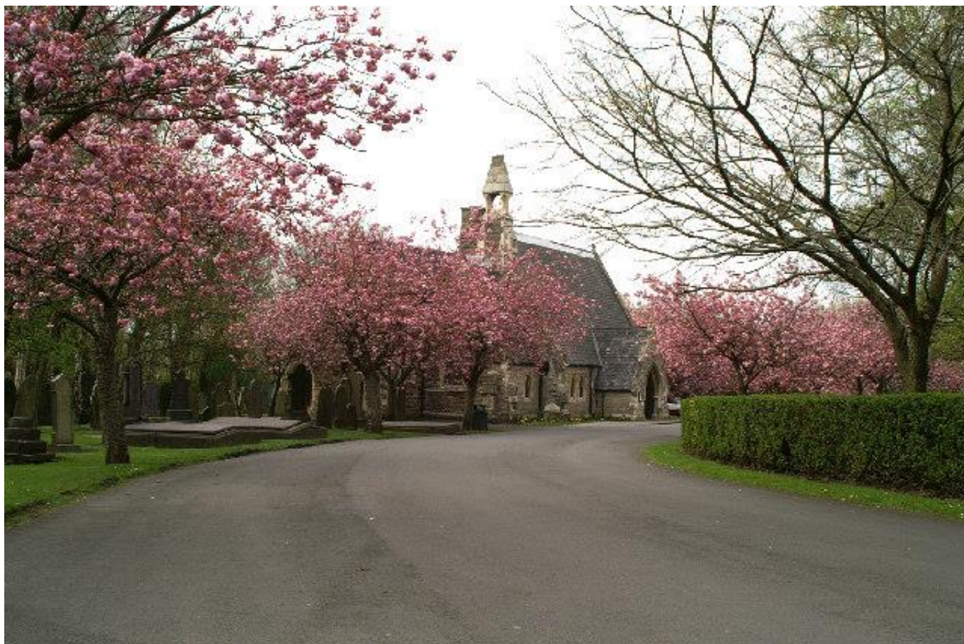
The former Wigan Cemetery Chapel, now Crematorium

Wigan Cemetery contains 191 Commonwealth War Graves – 108 from World War 1 & 83 from World War 2. Also known as Lower Ince Cemetery.