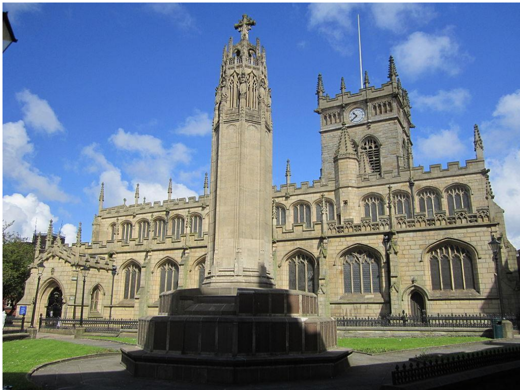
Wigan War Memorial